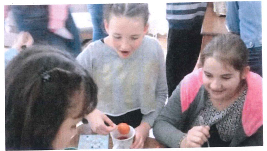
English class students having fun!

God continues to use the Greenhouse Project to move families toward self-sustainability, as well as to provide opportunities to share God's love in a