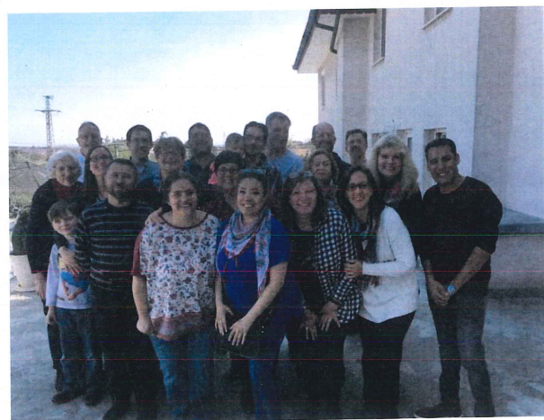
Recent Theological Education conference TE Students