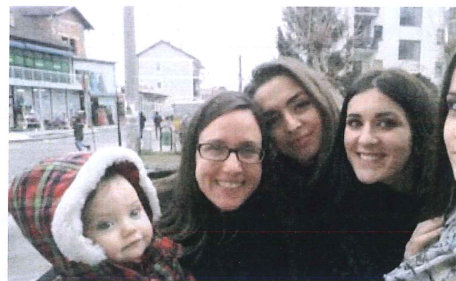
Spending time with our Kosovar friends