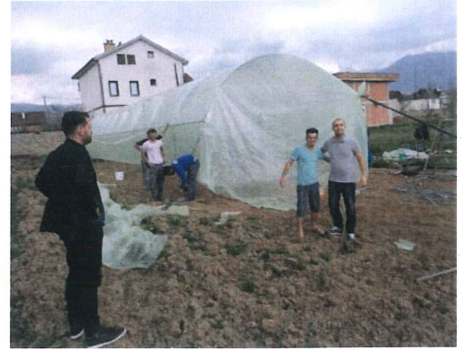
Two new greenhouses this year ← Visiting a greenhouse family

God continues to work through children's ministries, both at the local churches and in the community. Recently one of our believers, along with our support, started working with local Roma families after we realized that the kids were not enrolled in school. She not only meets with them daily to help them with reading and writing; she also has advocated for them in the schools and is working with the families to help them prepare their kids for school daily. It has been amazing to see God work through this local believer to make a significant impact in the lives of families who are living in desperate poverty.